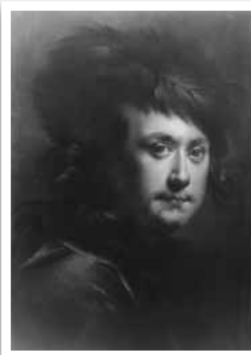
Self-Portrait wearing a Black Feathered Hat. By Joseph Wright, circa 1773-6.