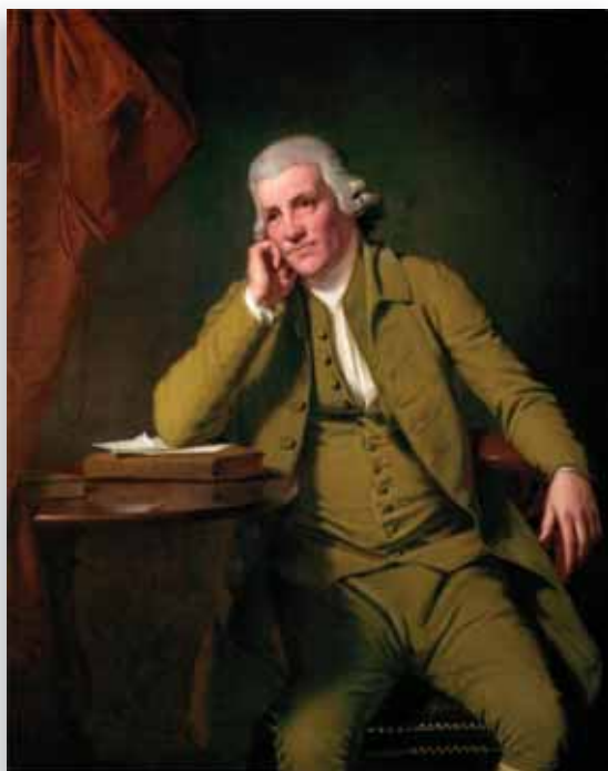
Jedediah Strutt. By Joseph Wright, c. 1790.