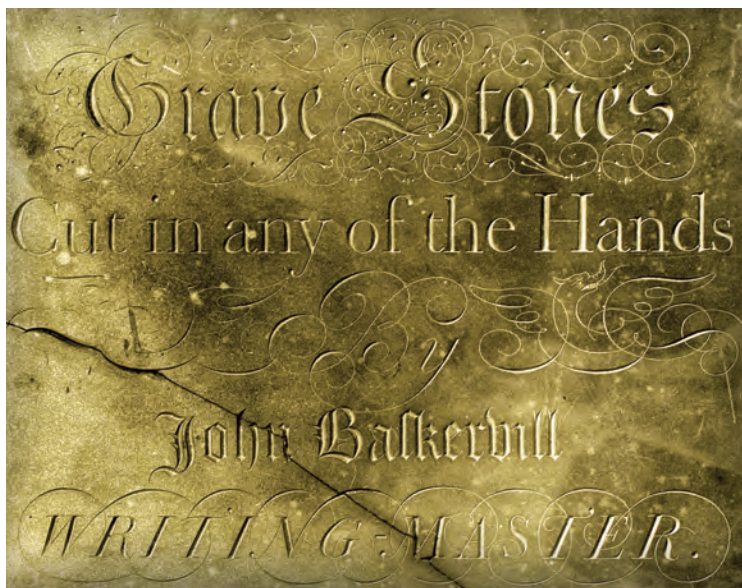
Slate advertising Baskerville as a stone carver.