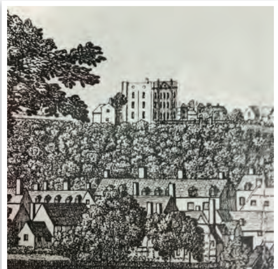
A view of Easy Hill, Baskerville's house in Birmingham, from Bradford's map, 1758.