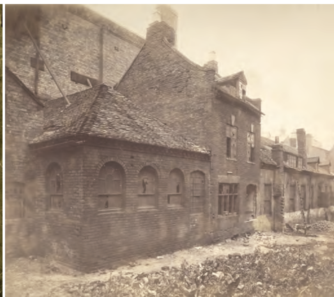
Baskerville's type foundry in Birmingham on the eve of demolition, 1887.