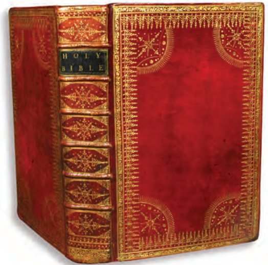
Matthew Boulton's copy of the Baskerville Bible.

In 1826 his body was exhumed and exhibited for some time in a shop in Birmingham. In 1829 it was placed in a vault at Christ Church, where it was rediscovered in 1893.