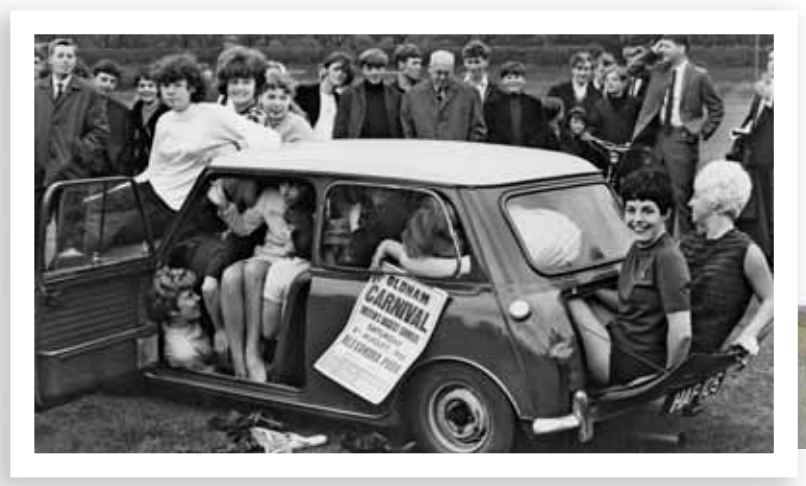
21 Oldham girls crowd into a Mini in 1966. The small car was designed in the Midlands by Alec Issigonis.

Statue of Randolph Turpin in the centre of Warwick. Sculpted by Carl Payne and unveiled in 2001.