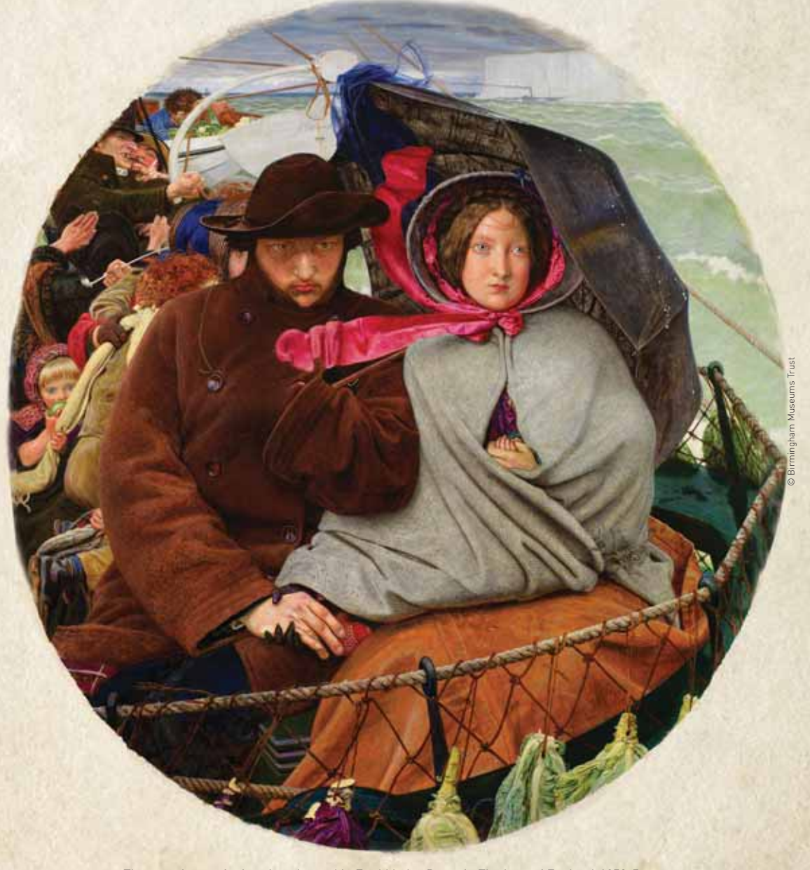
The experience of migration pictured in Ford Madox Brown's The Last of England, 1852-5.

While population studies give us the 'big picture', tracing general trends in relation to migration, it is individual stories which bring history to life and illustrate most powerfully for us some of the factors which lie behind it.