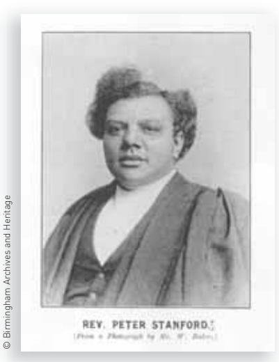
Rev'd Peter Stanford, an African American former slave and Birmingham's first Black minister. Birmingham Faces and Places , Vol. VI, 1894.