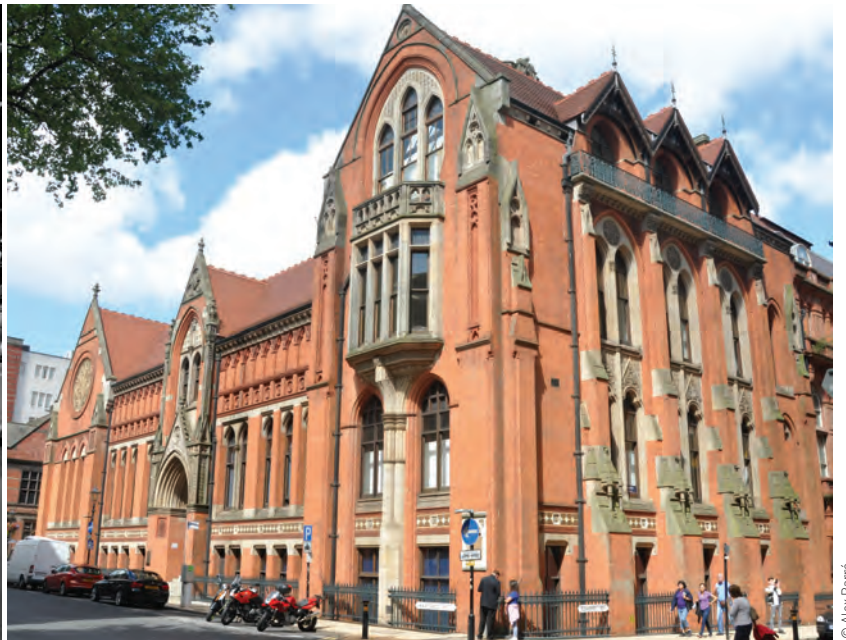
The School of Printing was based at Birmingham's famous Art School in Margaret Street.