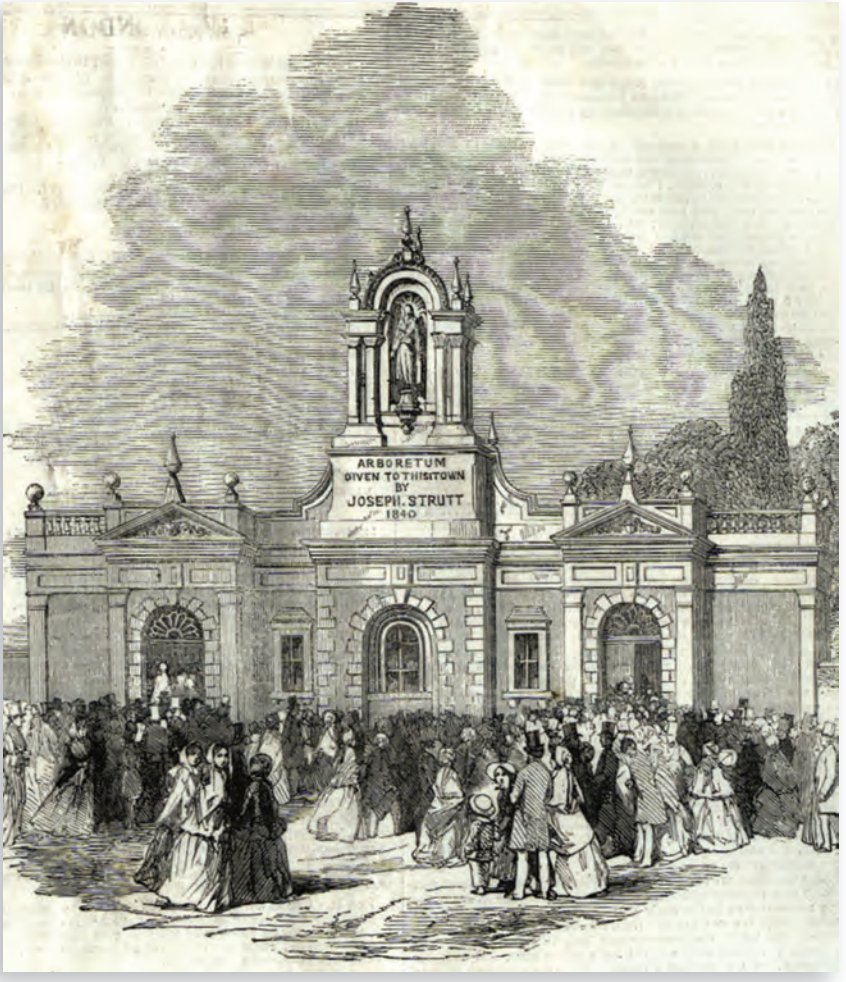
Derby Arboretum Anniversary Festival, London Illustrated News, 8 July 1854.

Supported like the Birmingham Botanical Gardens by donations, subscriptions and entrance fees, following Strutt's instructions, the park was opened free to the public for two days per week, and became tremendously popular, holding special anniversary events with balloon launches, fireworks and circus acts attended by tens of thousands, for example, which provided much-needed annual replenishment for the coffers until it was eventually acquired by the corporation in 1882.