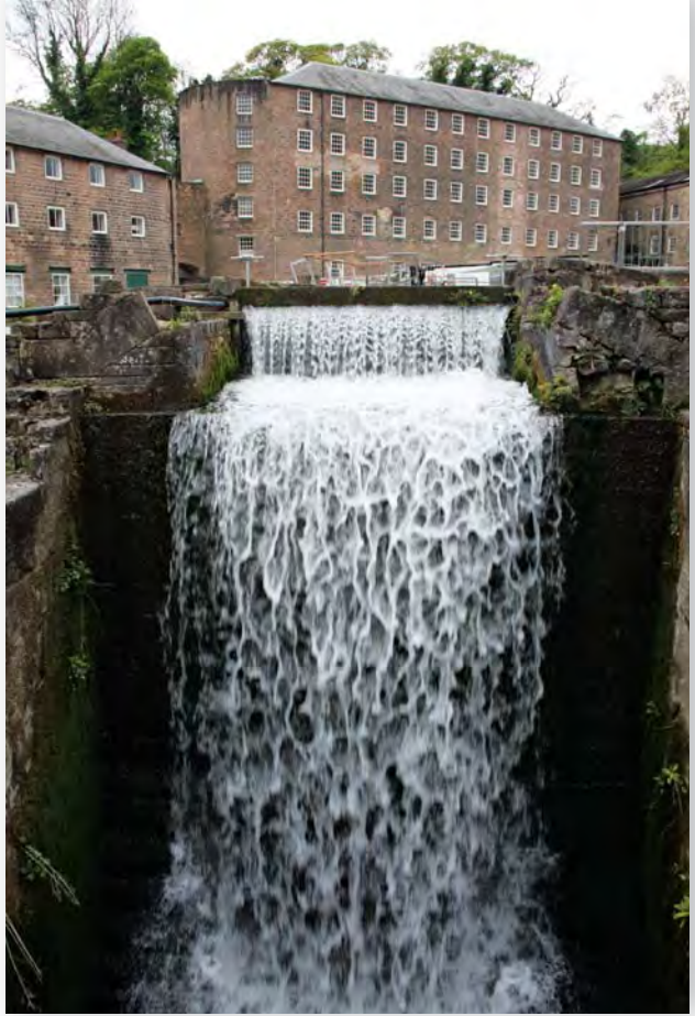
The Derwent River was harnessed to power the machinery for the Derwent Valley Mills, Derbyshire.

The World Heritage Convention at its heart concerns the protection of the world's common heritage for future generations. Inscription onto the World Heritage List acts as a way of identifying which sites have special global significance and of encouraging their protection. The World Heritage label does not come with any funding, and a site receives no money from UNESCO. The World Heritage label is often associated, rightly or wrongly, with an increase in tourism to an area.