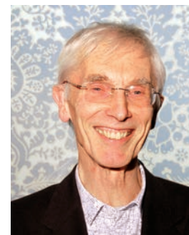
Les Sparks OBE