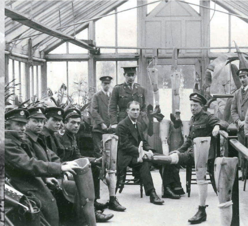
Highbury was used as a convalescent hospital during the First World War

In 1919 Joseph's son Austen conveyed the original estate to the Highbury Trust which In 1932 then gave it to Birmingham City Council as sole Trustee 'for the general benefit of the citizens of Birmingham.'